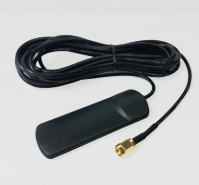
WiFi / BT Antenna