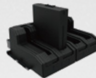
4-bay Battery Charger