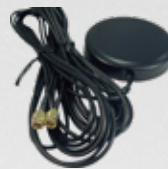
WIFI / BT Antenna