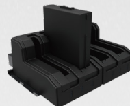
4-bay Battery Charger